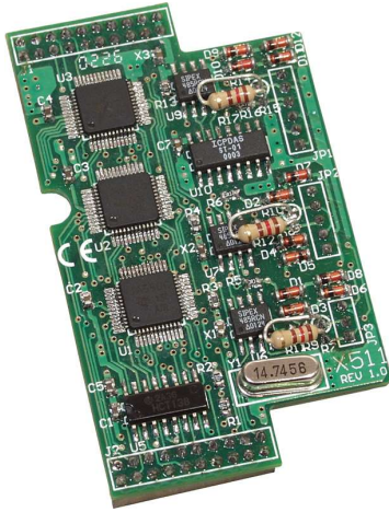
X511 3-Port RS-485