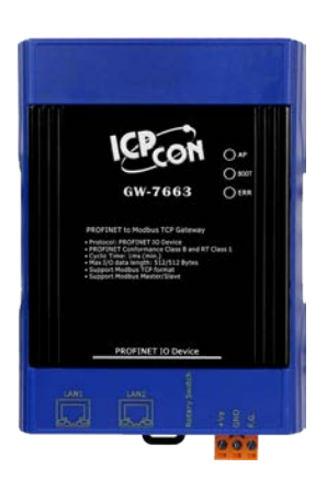
GW-7663 PROFINET to Modbus TCP Gateway