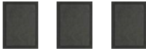
Filter Patch (For CL-22X-WF Series) * 3