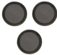
Filter Patch (For CL-21X-WF Series) * 3