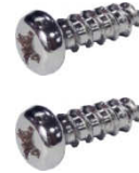
M4x12L Drywall Screws* 2