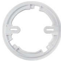
Mounting Plate Filter