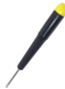
Screw Driver (1C016)