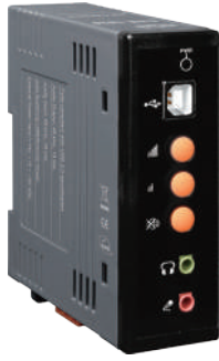
USB-2020 USB Audio Device