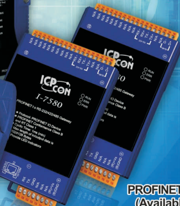
PROFINET Gateway (Available Soon)