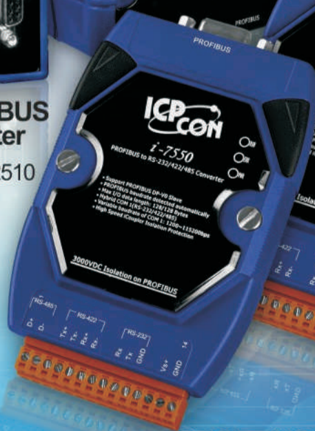
PROFIBUS Converter I-7550