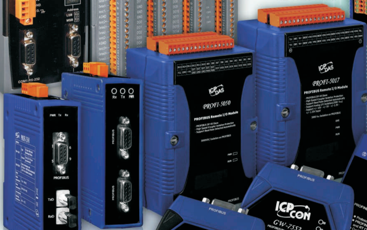
PROFIBUS I/O Module